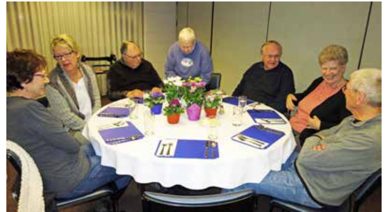
Members of the Hope Church Kids Hope Team enjoy a meal together at the annual Appreciation Dinner on Wednesday, February 22nd.