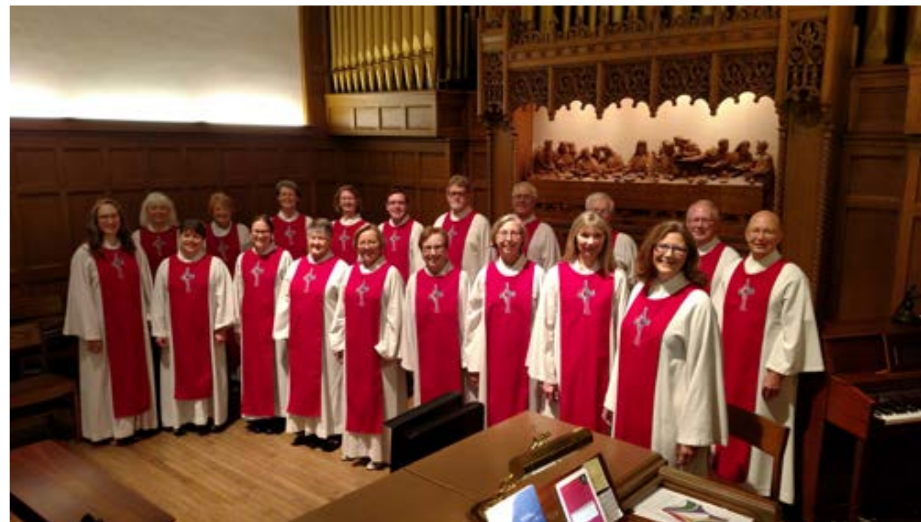
The Hope Church Chancel Choir: new singers are always welcome!

As the choir prepares music for each 11 a.m. worship service, there are two services to be intensely rich in music. On October 4, we celebrate World Communion with new and loved global music selections, many of which are in our hymnals. On October 25 the choir will sing "Room for All," a song written for and inspired by the mission of the Room for All organization.