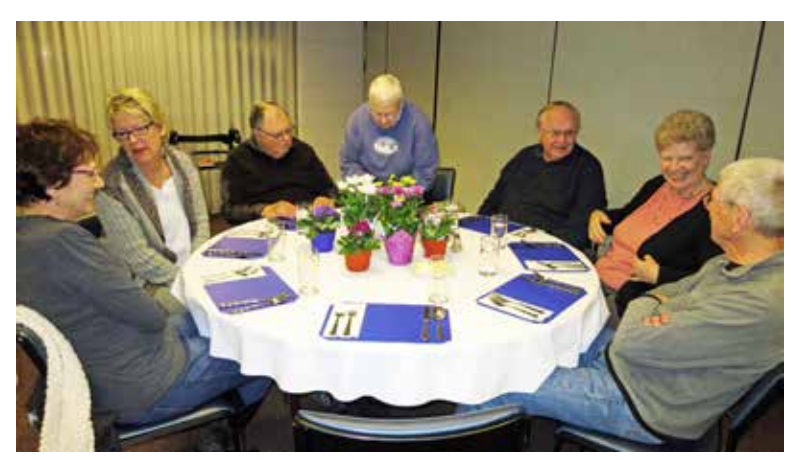
Members of the Hope Church Kids Hope Team enjoy a meal together at the annual Appreciation Dinner on Wednesday, February 22nd.