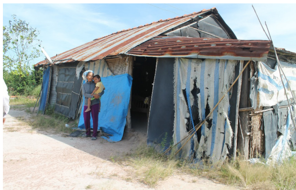
Phuoc & Thi Toi home: Before and After