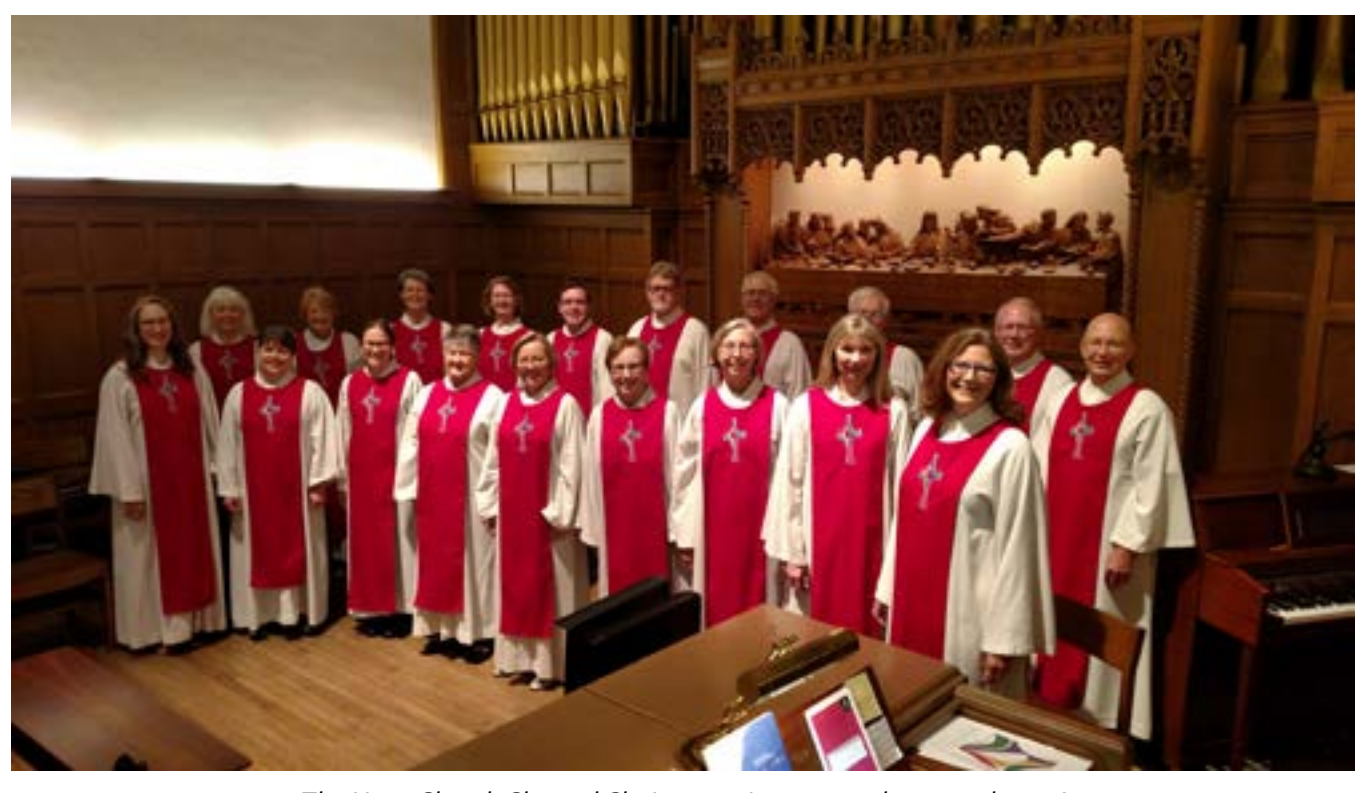
The Hope Church Chancel Choir: new singers are always welcome!

As the choir prepares music for each 11 a.m. worship service, there are two services to be intensely rich in music. On October 4, we celebrate World Communion with new and loved global music selections, many of which are in our hymnals. On October 25 the choir will sing "Room for All," a song written for and inspired by the mission of the Room for All organization.