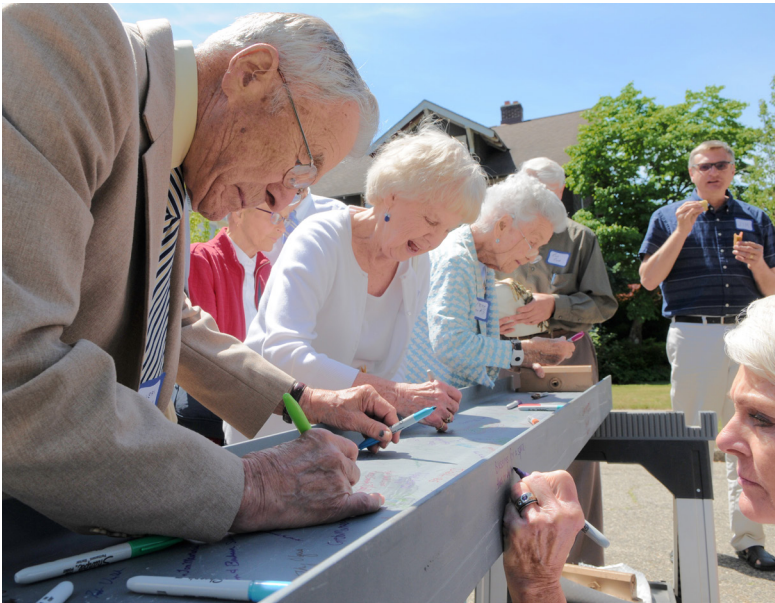
Congregation members signed and wrote blessings on a beam that will be part of the new construction.

On Sunday, June 12, 2016, we celebrated the beginning of construction that will provide facilities that are more welcoming, flexible, accessible, and sustainable!