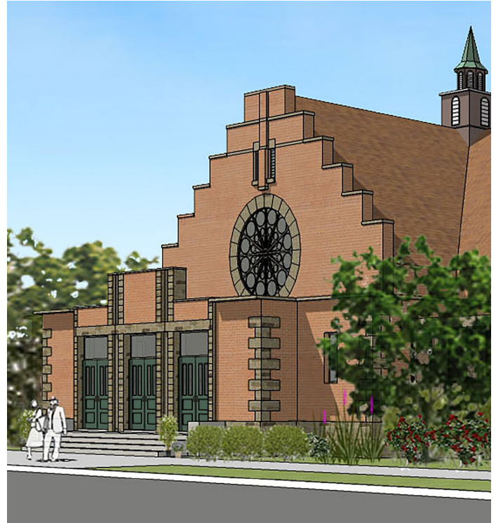
Planned Door Replacement

The doors and frames are being replaced in pairs, to keep the narthex useable on each Sunday during the work. The first week of November, all of the doors are planned to be complete and the concrete stairs at that entrance will also be repaired.