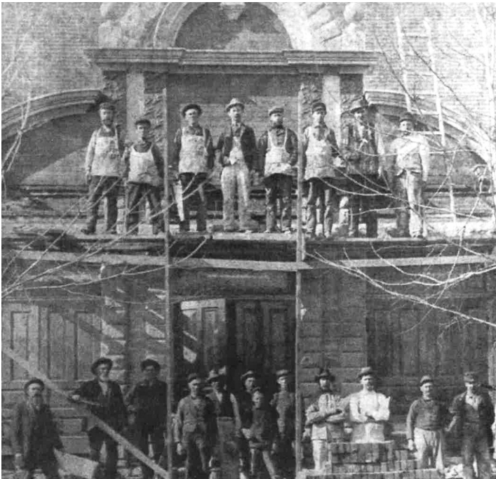
Front of Hope Church under construction in about 1900